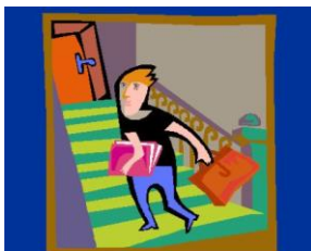
Lifestyle Physical Activity

What is the difference between physical activity and exercise? The answer is in the definition